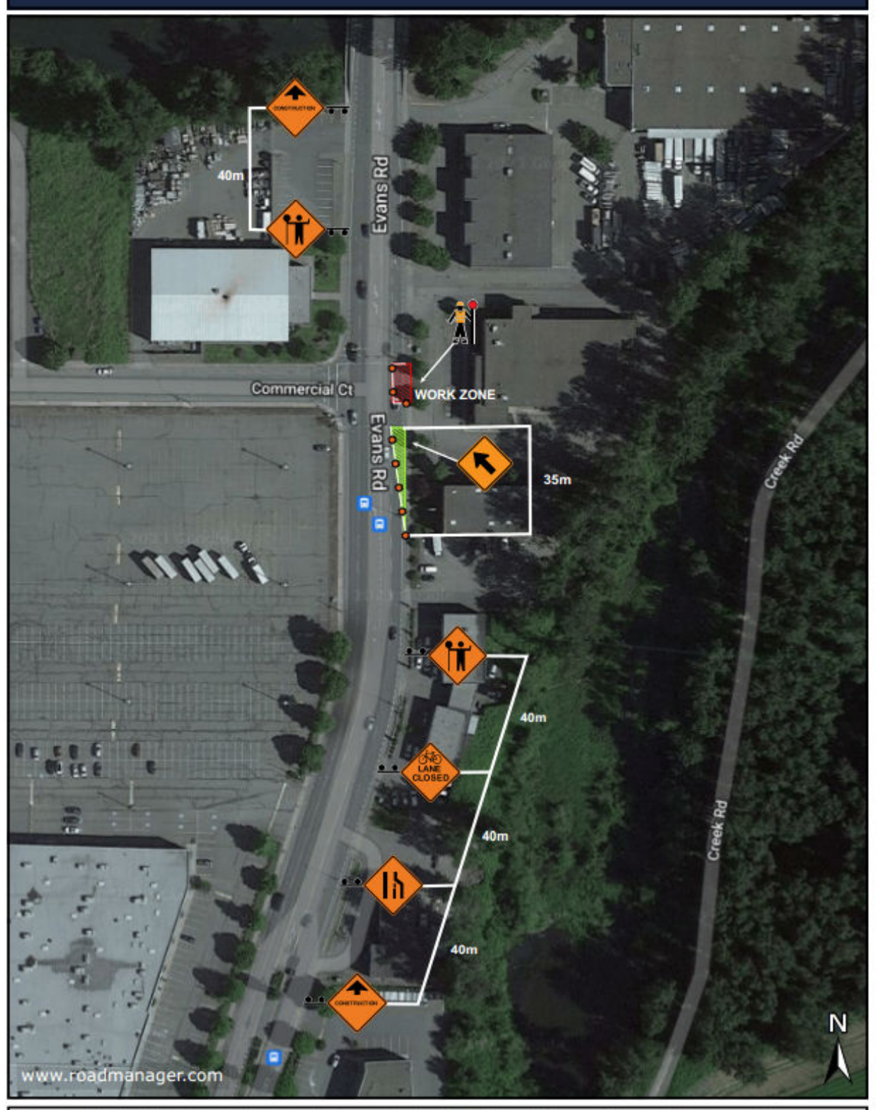
Figure 11.6: Right Lane Closure (Near Side) – Multilane Intersection – Short and Long Duration